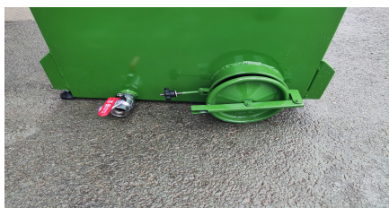
Drain valve and manhole for cleaning